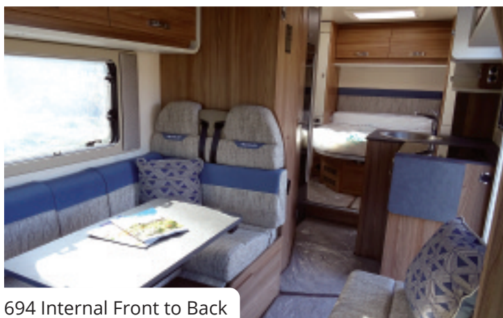
694 Internal Front to Back