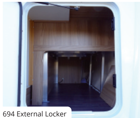
694 External Locker