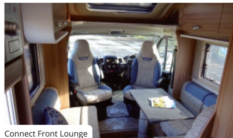
Connect Front Lounge