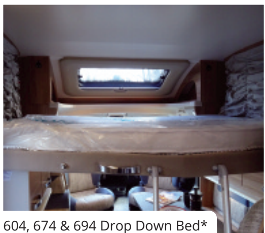
604, 674 & 694 Drop Down Bed*