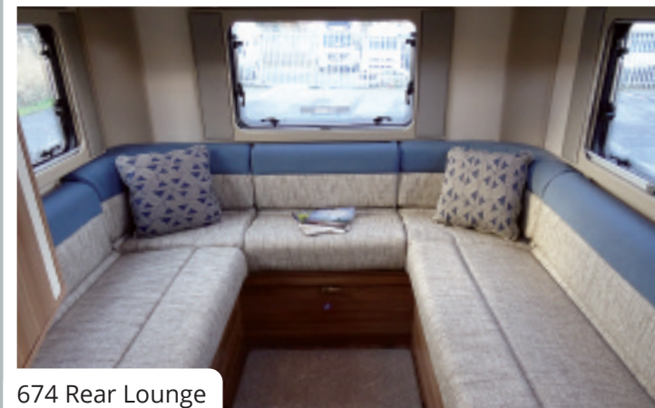
674 Rear Lounge