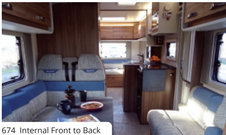
674 Internal Front to Back