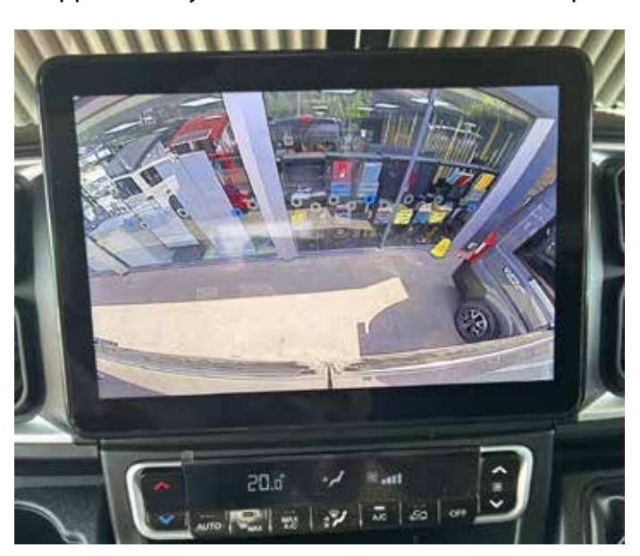
Fiat Integral Digital Rear Reversing Camera