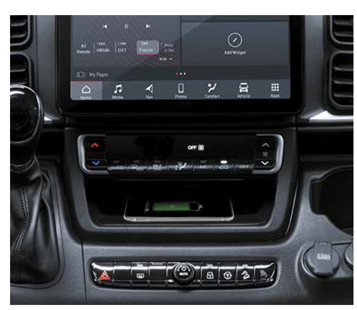
Wireless Phone Charging