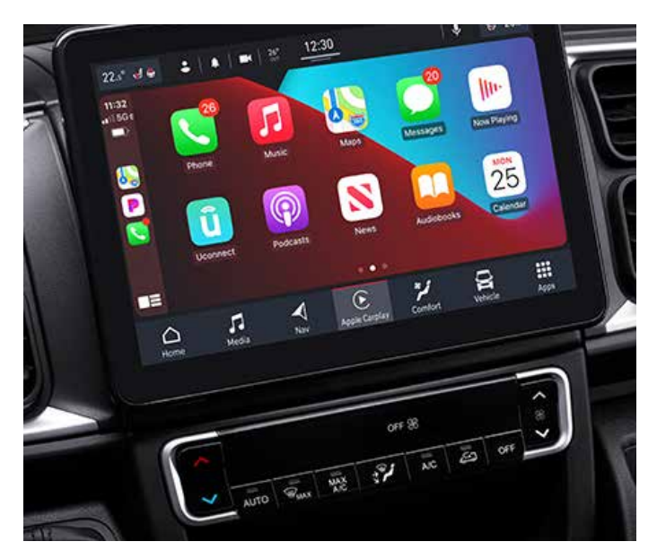
Apple Car Play, Android Auto & Tom Tom 3D maps