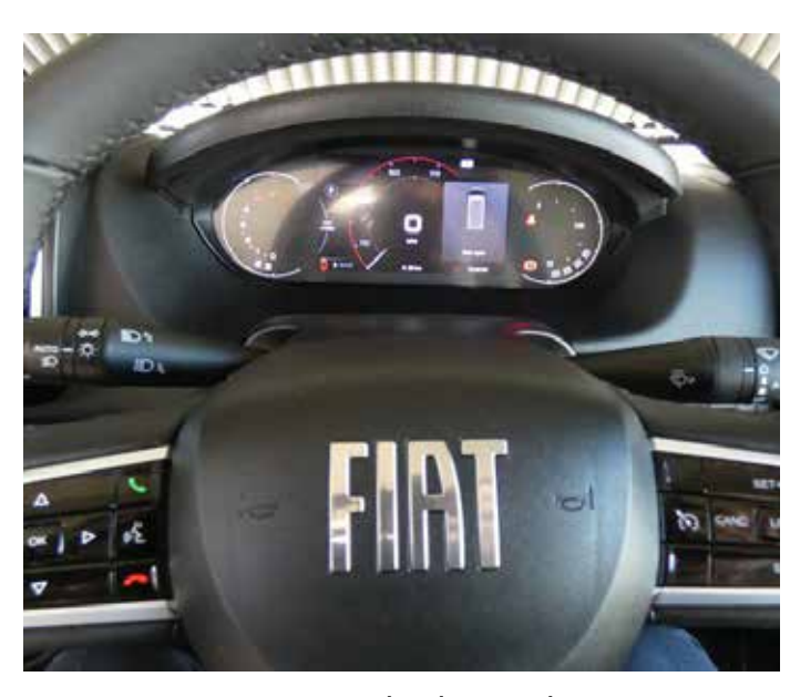
Steering Wheel Controls