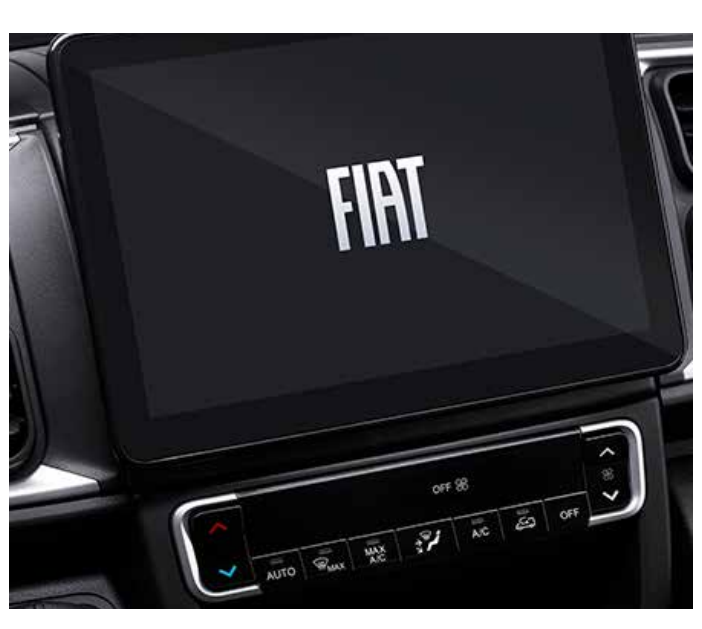
Fiat 10" Touchscreen Colour Display