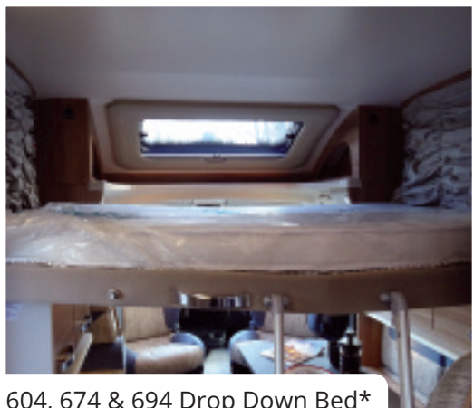
604, 674 & 694 Drop Down Bed*