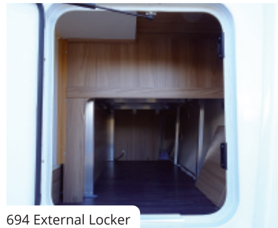
694 External Locker