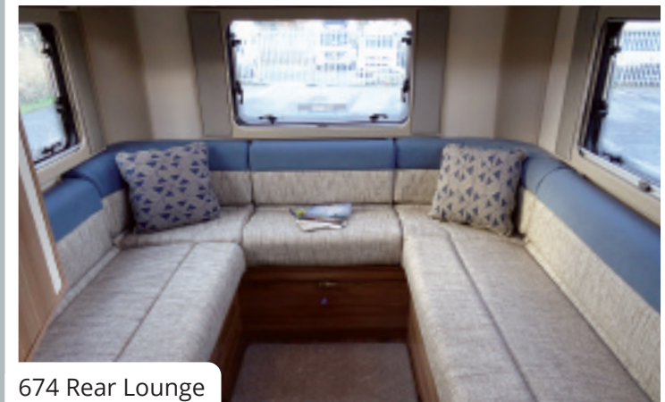
674 Rear Lounge