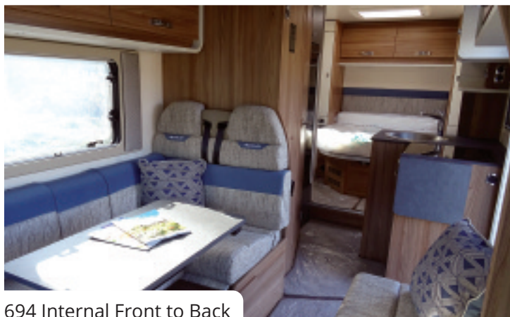
694 Internal Front to Back