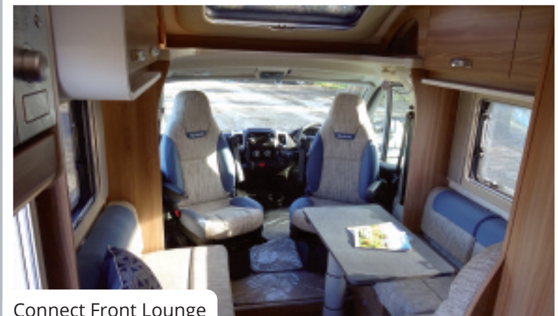
Connect Front Lounge