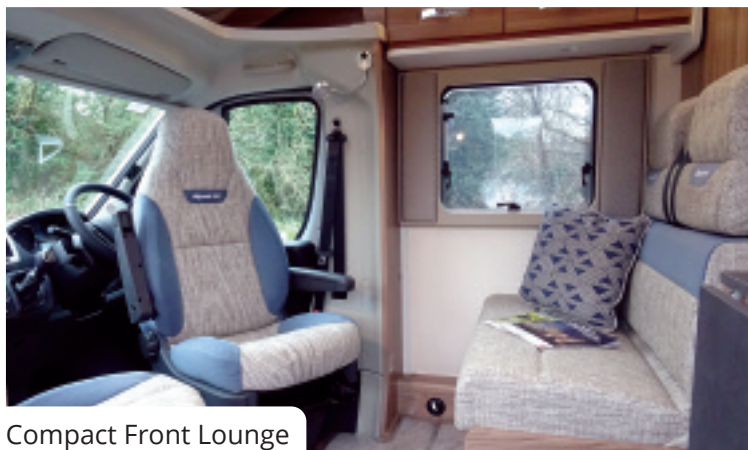
Compact Front Lounge