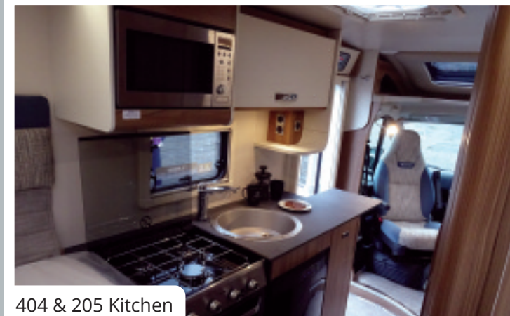
404 & 205 Kitchen