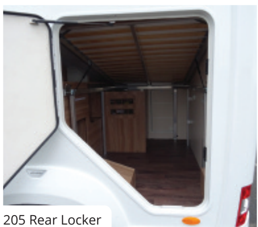
205 Rear Locker