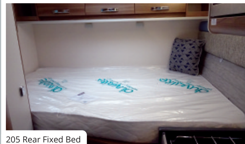
205 Rear Fixed Bed