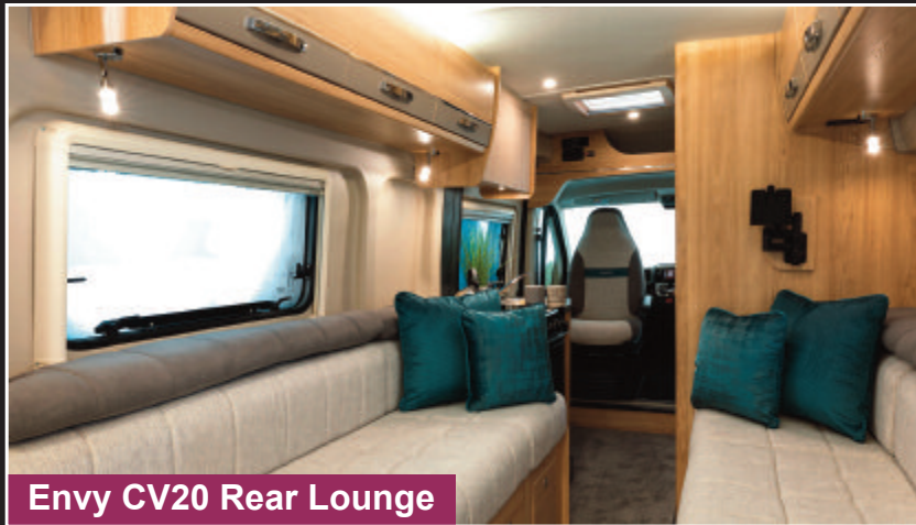
Envy CV20 Rear Lounge