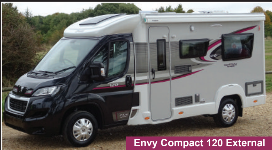
Envy Compact 120 External