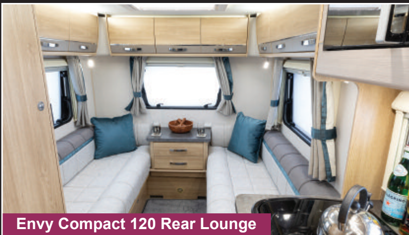
Envy Compact 120 Rear Lounge