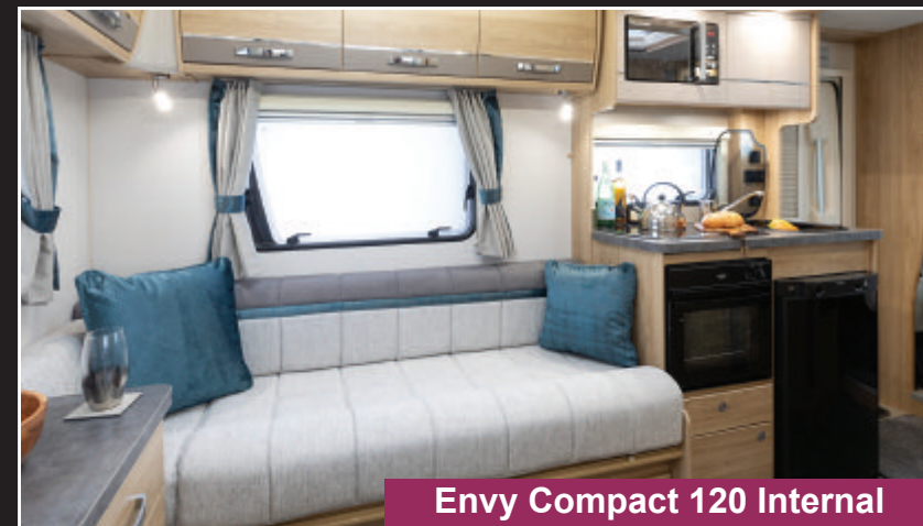
Envy Compact 120 Internal