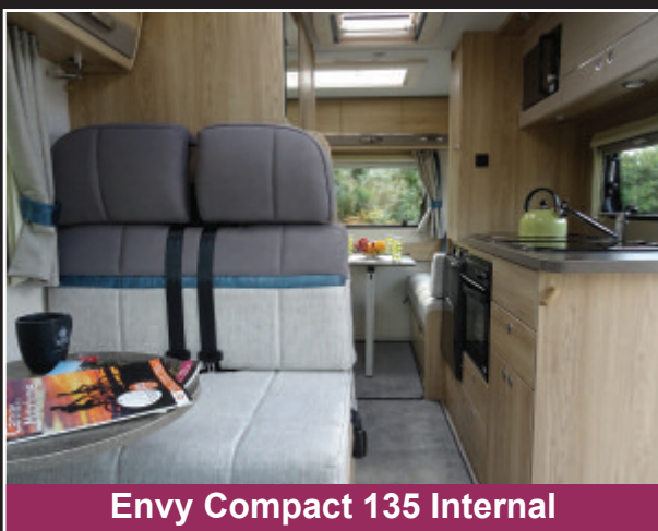
Envy Compact 135 Internal