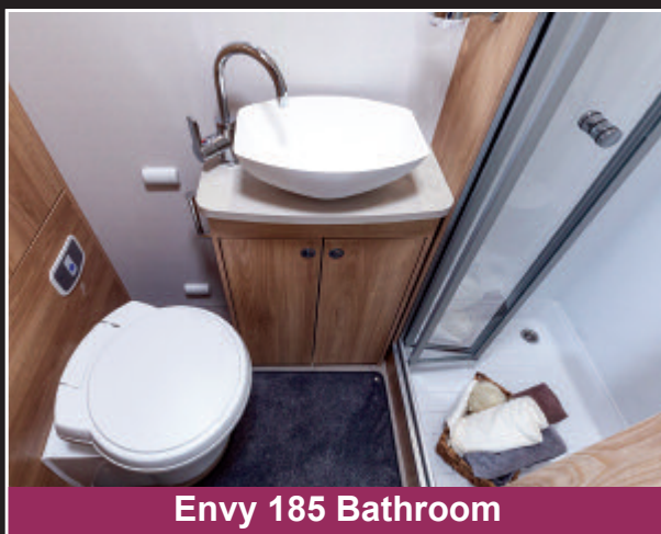
Envy 185 Bathroom