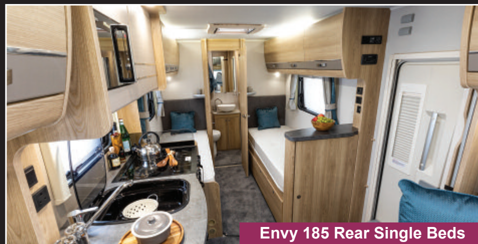
Envy 185 Rear Single Beds