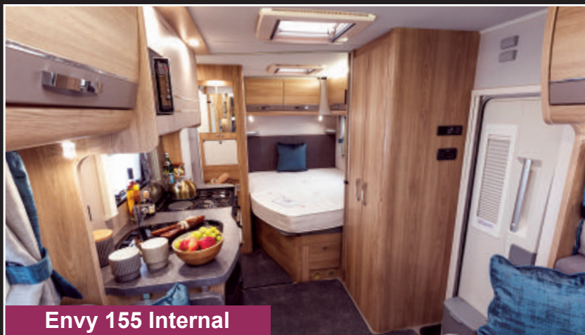
Envy 155 Internal