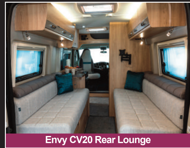
Envy CV20 Rear Lounge