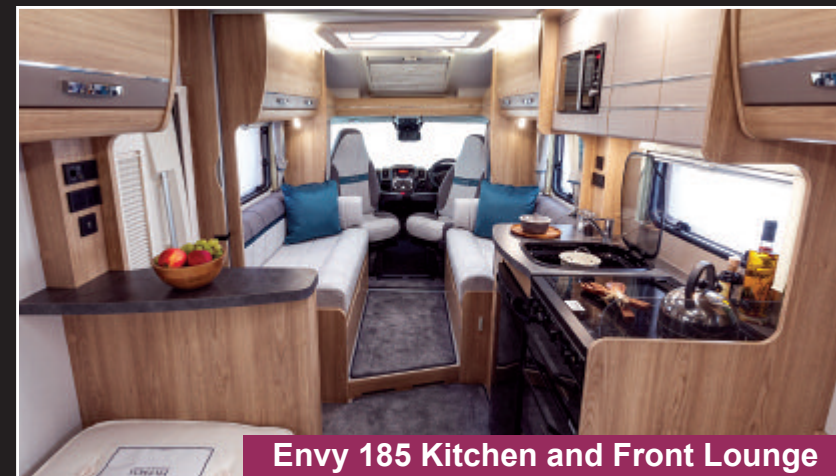
Envy 185 Kitchen and Front Lounge