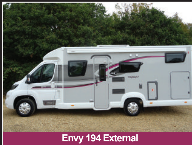
Envy 194 External