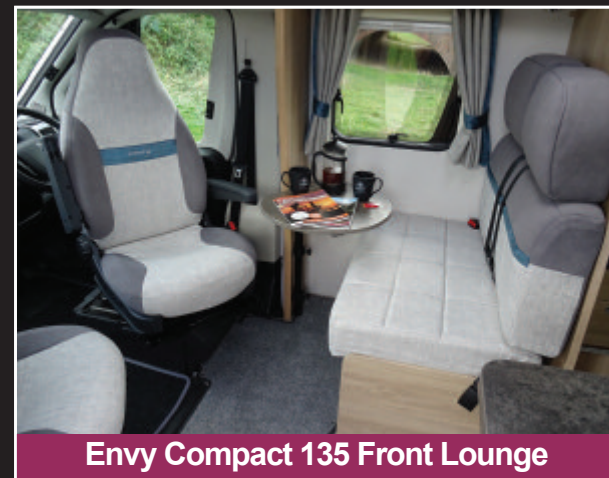
Envy Compact 135 Front Lounge