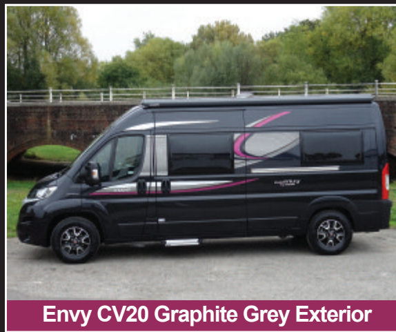
Envy CV20 Graphite Grey Exterior