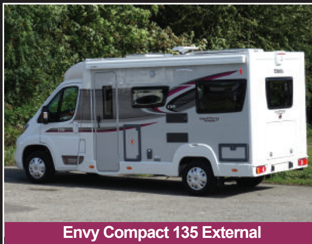
Envy Compact 135 External