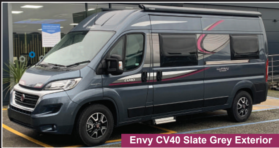
Envy CV40 Slate Grey Exterior