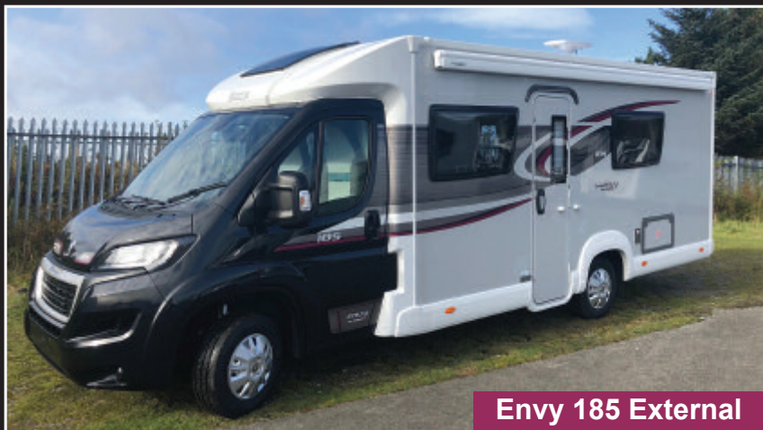
Envy 185 External