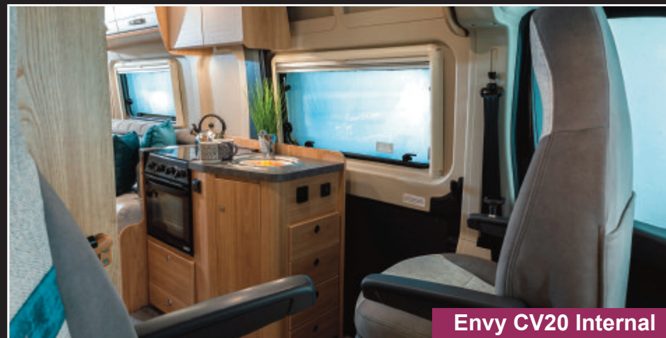
Envy CV20 Internal