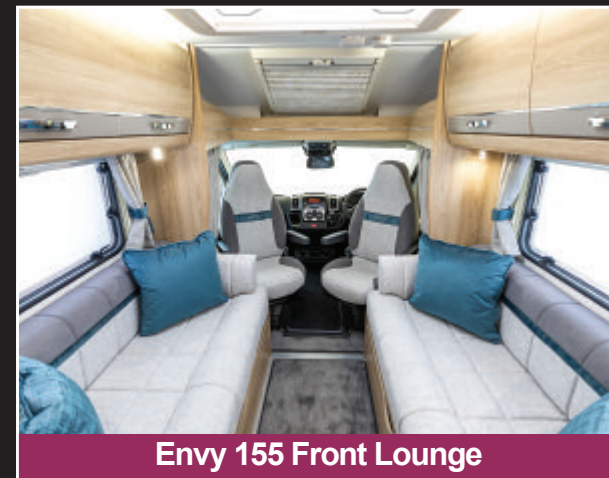
Envy 155 Front Lounge