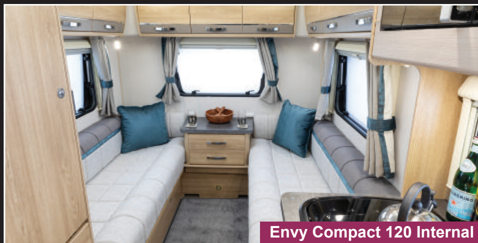
Envy Compact 120 Internal