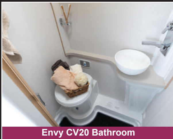
Envy CV20 Bathroom