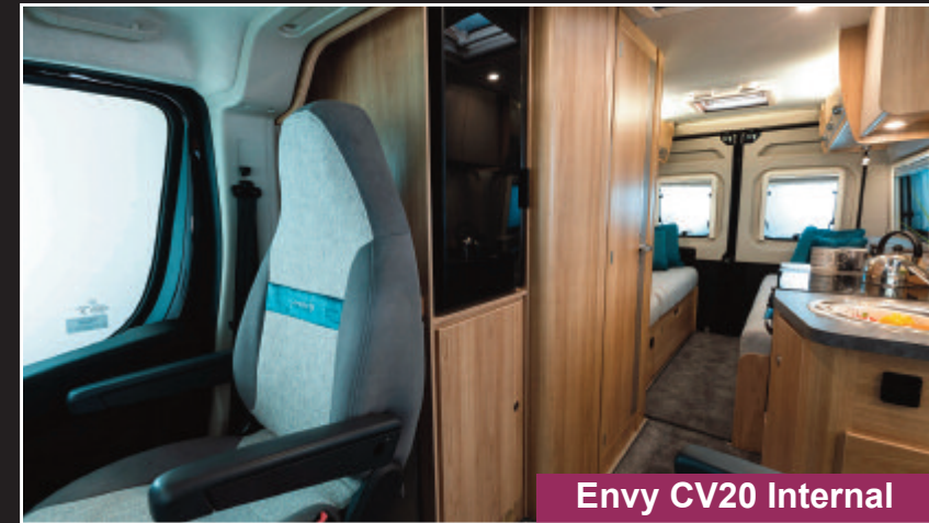
Envy CV20 Internal