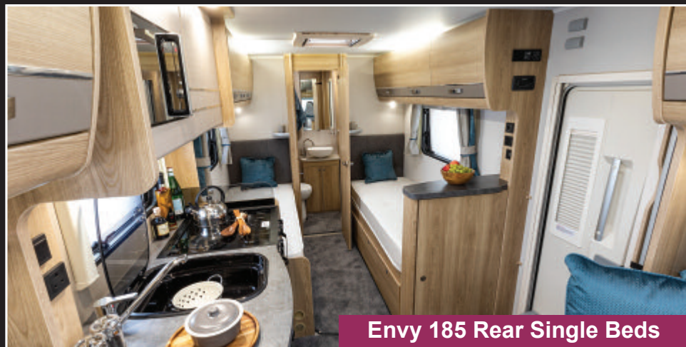
Envy 185 Rear Single Beds