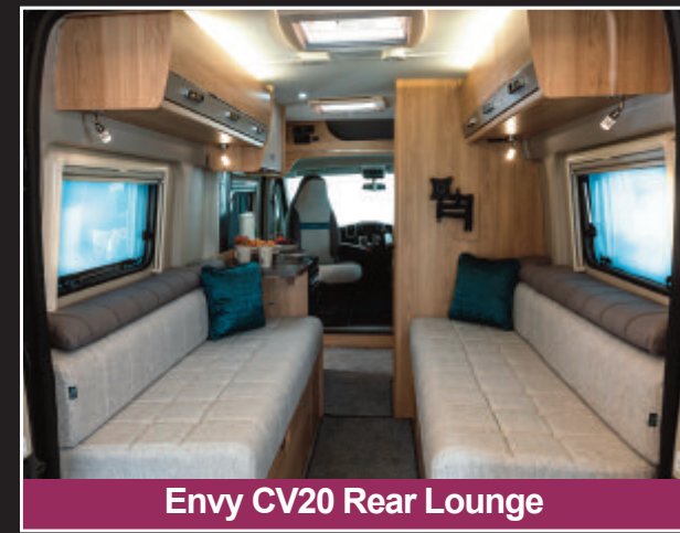
Envy CV20 Rear Lounge