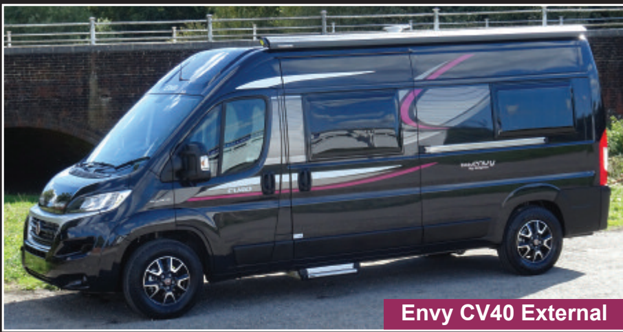
Envy CV40 External