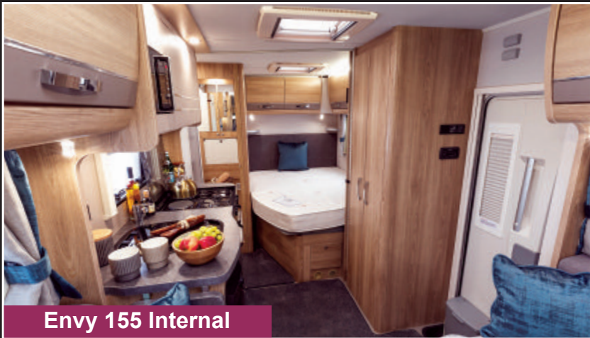
Envy 155 Internal