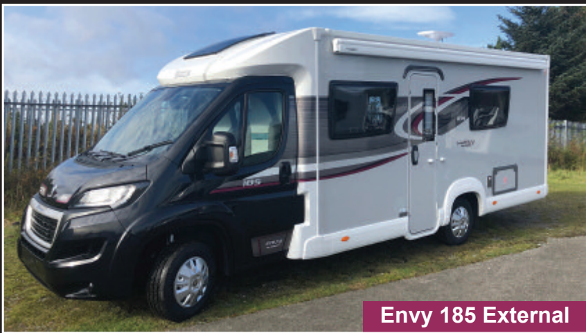
Envy 185 External