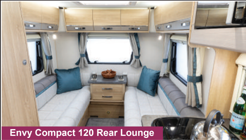
Envy Compact 120 Rear Lounge