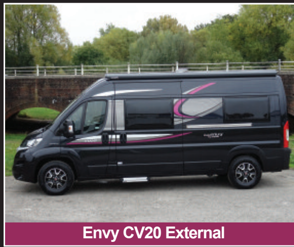
Envy CV20 External