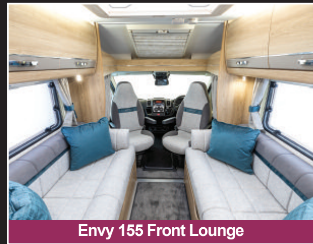
Envy 155 Front Lounge