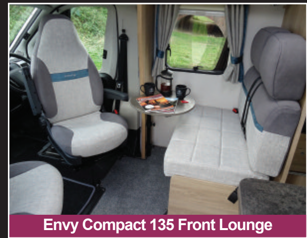
Envy Compact 135 Front Lounge