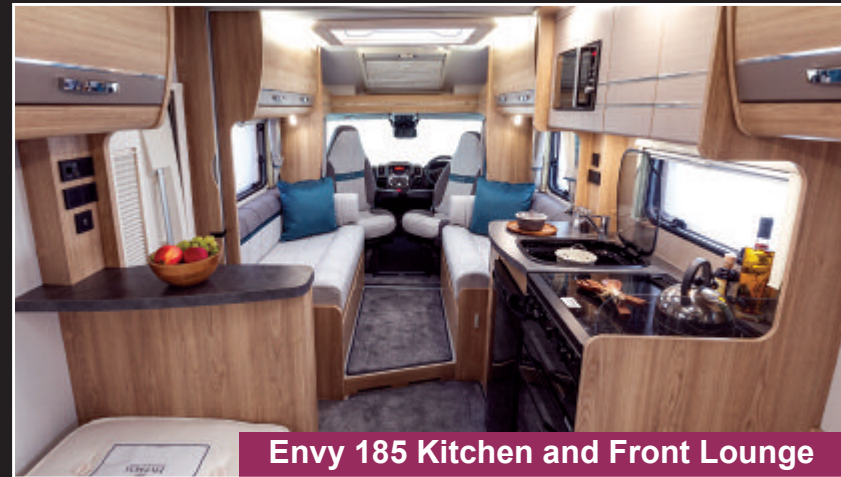
Envy 185 Kitchen and Front Lounge