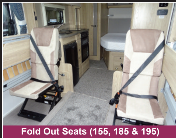
Fold Out Seats (155, 185 & 195)