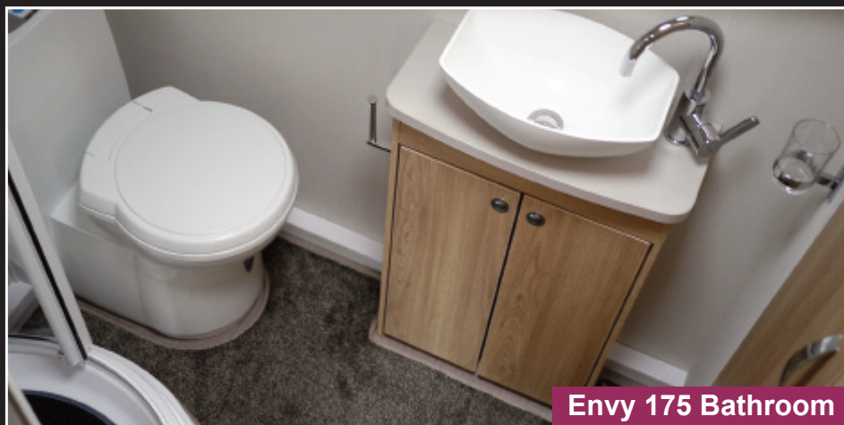
Envy 175 Bathroom