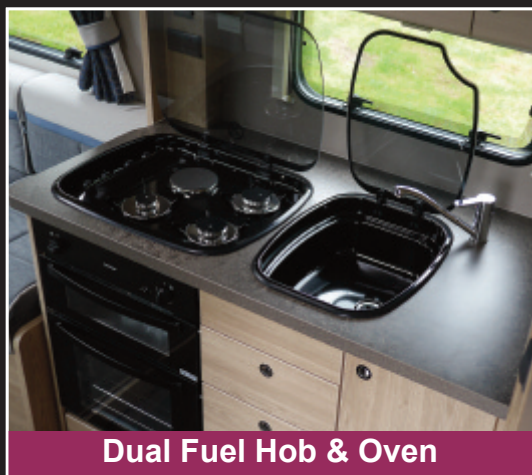
Dual Fuel Hob & Oven