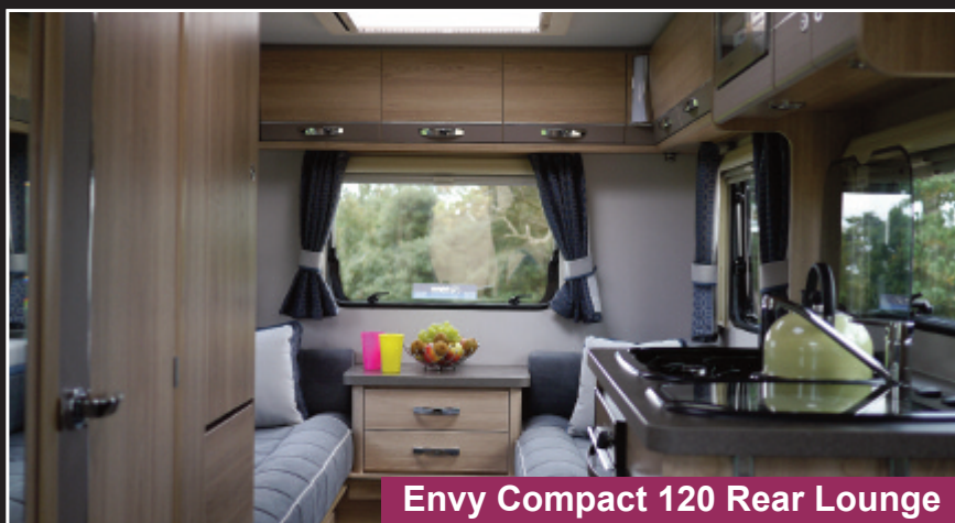
Envy Compact 120 Rear Lounge