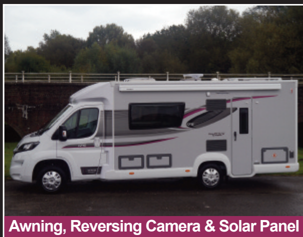
Awning, Reversing Camera & Solar Panel