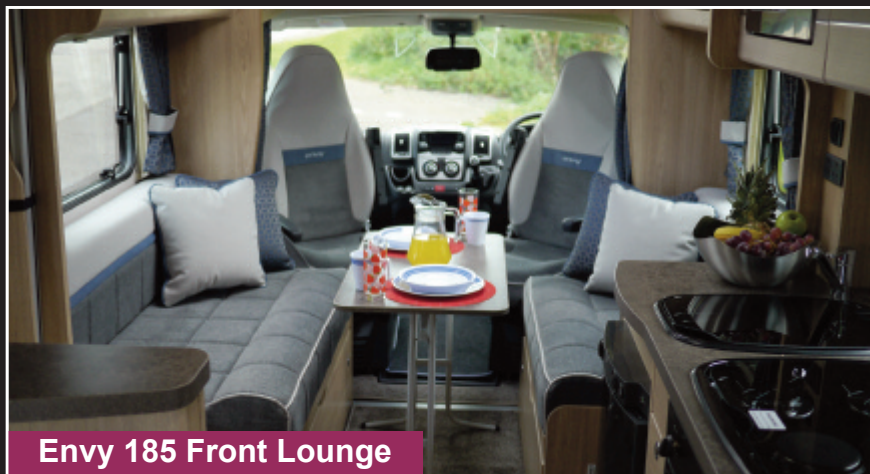
Envy 185 Front Lounge